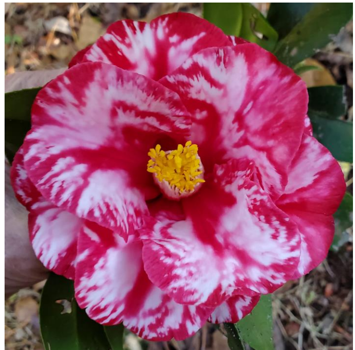
Ville de Nantes

Debbie Ellis reported that the tables for the 2025 Show have been ordered, and work has begun on assembling goodie bags for the judges. Debbie also told us that GCS t-shirts and polos will be available for purchase and she hopes all Show participants will wear one. She passed around a sheet for people to sign up to be clerks at the Show and to provide food and drinks for the rest of our meetings, and to purchase shirts. She'll have examples of the shirts at the next meeting.